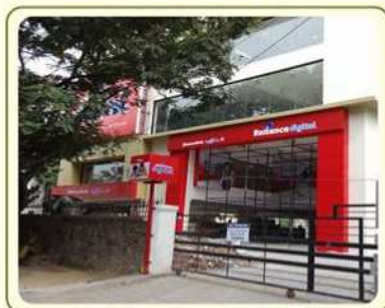
RELIANCE DIGITAL Kilpauk, Chennai