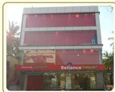
RELIANCE FOOTPRINT Bangalore