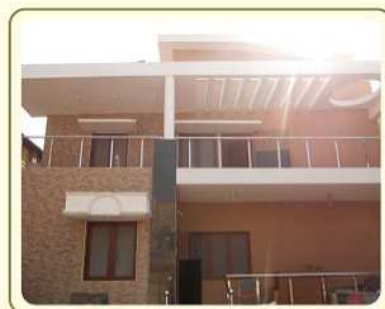
VILLA Kundrathur, Chennai