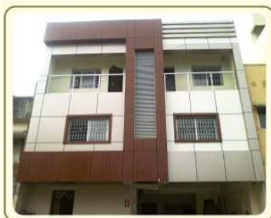
MIXED USE DEVELOPMENT Chinthadripet, Chennai