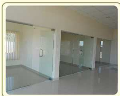
AZVEN REALITY (MARKETING OFFICE) Sarjapur, Bangalore