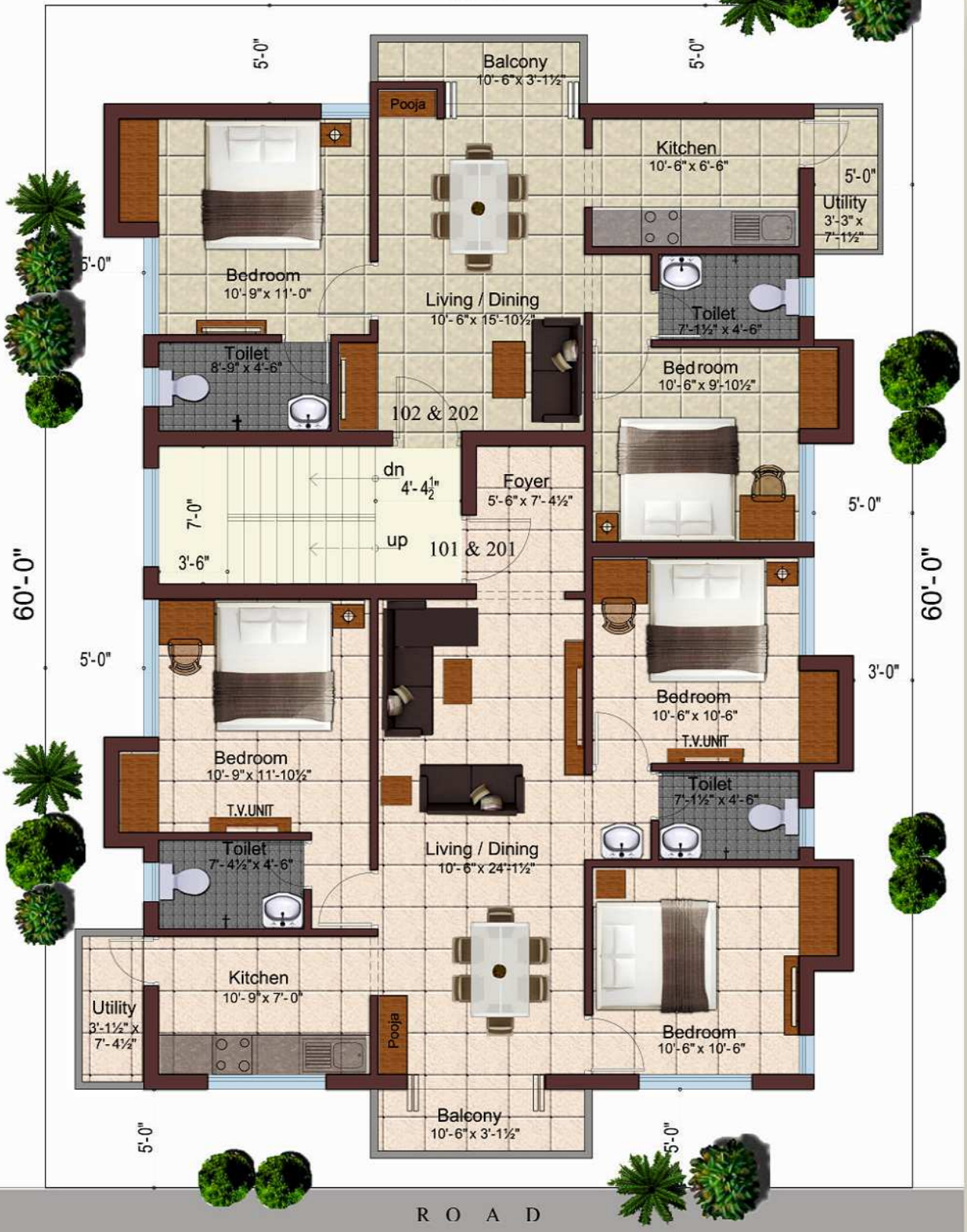
First & Second floor plan ( Typical )