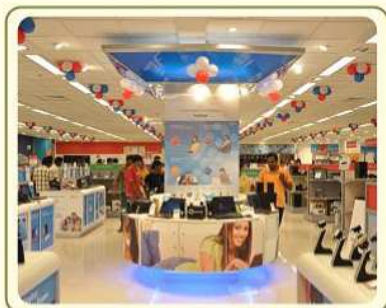
RELIANCE DIGITAL Coimbatore