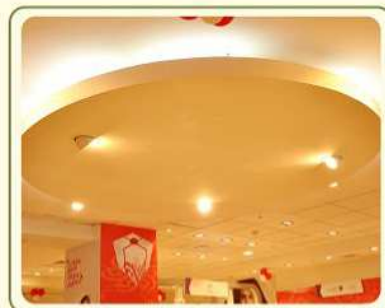
RELIANCE TRENDS Coimbatore