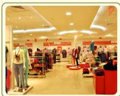
RELIANCE TRENDS Chrompet, Chennai