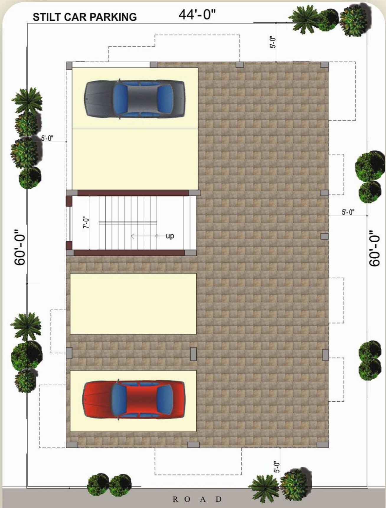
Stilt floor plan